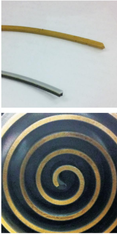
Figure 1 - Solid Tip Design (with Foam Backed Tip Seal at Left)